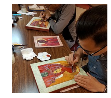
Note: For various reasons, the icon produced will vary somewhat from the image on the brochure.

All materials—a gessoed board, paint materials, brushes, a palette, and gold leaf—and tools will be provided. No preparation is expected before the workshop begins. You may want to bring a desk lamp, pen, notebook, coffee/tea cup, and a cloth to cover your icon. Basic students should return home with a completed icon.